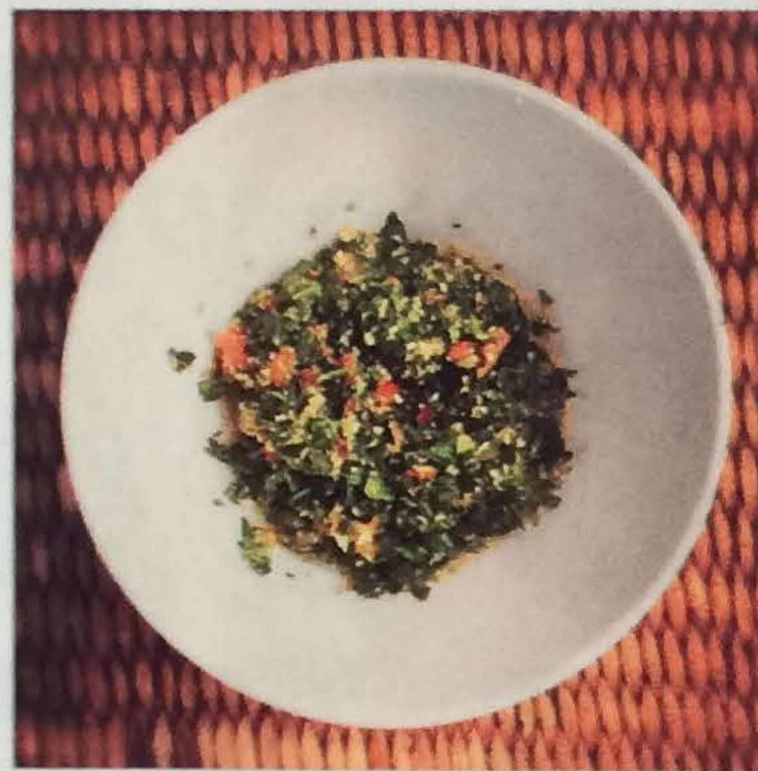
Summer switch-up: Make grain-free tabbouleh salad with raw cauliflower instead of bulgur.