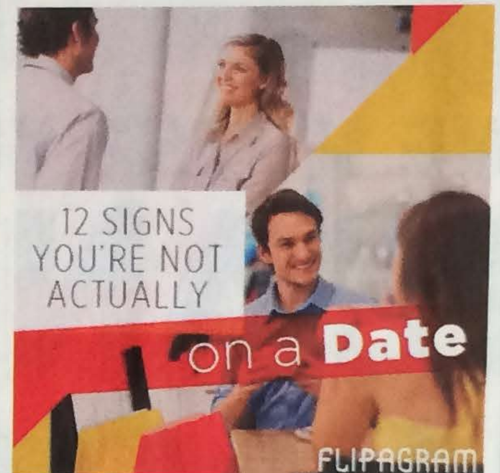
You laughed at our signs that you're not on a date. Ugh, that dreaded handshake good-bye...