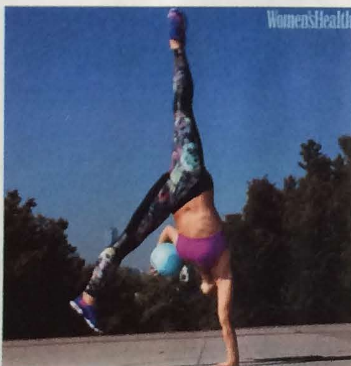
Over 1,000 of you were impressed by this strong one-arm handstand (and her wicked-cool pants!).