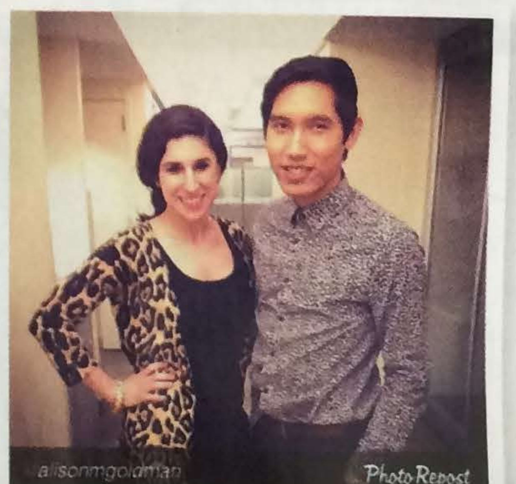
On Wednesdays, our online editorial staff wears leopard! Follow us: @WomensHealthMag.